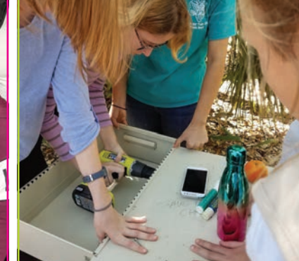
COOKIE PALOOZA Entrepreneurship