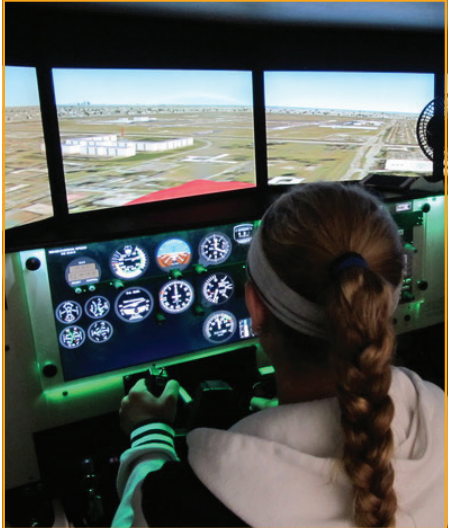
WOMEN IN AVIATION STEM